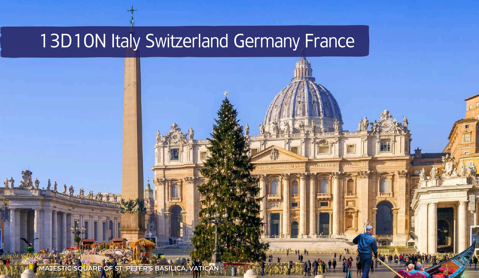
MAJESTIC SQUARE OF ST. PETER'S BASILICA, VATICAN