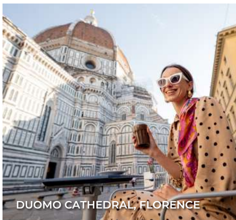
DUOMO CATHEDRAL, FLORENCE

Head to one of Italy's best-known luxury shopping outlets under The Mall and enjoy savings up to 70%! Check out some of Italy high fashion's biggest names such as Prada, Ferragamo, Versace, Armani, Furla and a host of other fashionable brands. Our next stop is Florence , the 'Cradle of the Renaissance'. Stroll around Piazza della Signoria with its statues and stunning palazzi then view the Ponte Vecchio . Admire the legendary Duomo and the iconic Baptistry of St. John . See the area around Santa Croce Basilica , famous for the quality of its luxury goods, and witness a gold and leatherwork demonstration.